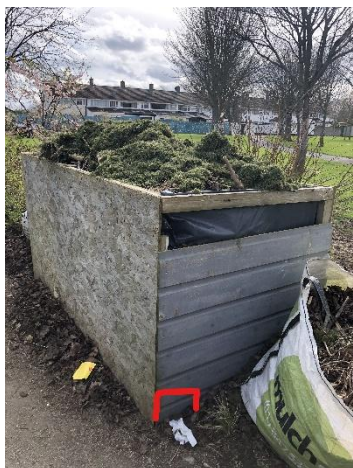
Compost pile in Bayside with a proposed 'hedgehog door' illustrated.