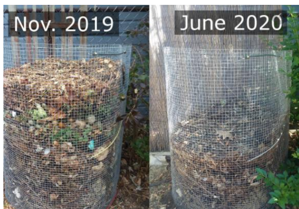
Example of a wire compost bin to hold leaves. Cut hole at bottom to let hedgehogs in and out. Leaves break down over time as you can see in picture.

The Irish Hedgehog Survey commenced in 2021 and is being co-ordinated by NUIG. It would be great for the garden users to link in with other local groups also participating in the Local Biodiversity Action Plan to complete a hedgehog survey. See https://www.irishhedgehogsurvey.com/ for further information.