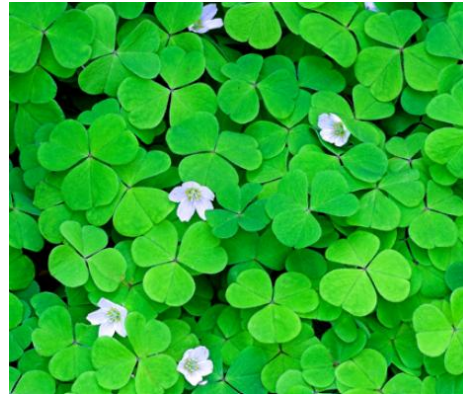
Wood Sorrel ( Oxalis sp. ) Perennial Flowers April-May Shade or partial sun Deciduous