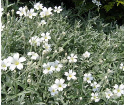
Mouse Ear Chickweed ( Cerastium sp. ) Perennial Flowers April – September Shade or sun Moist soil Evergreen Nice silver coloured leaves when not in flower