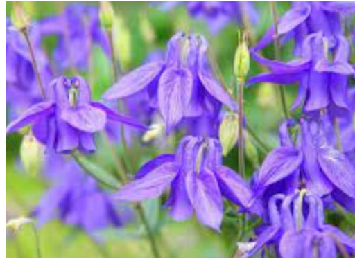
Columbine or Granny's Bonnet ( Aquilegia sp. ) Semi Evergreen/Perennial Partial shade Bloom May and June