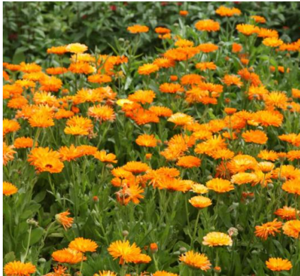
Pot Marigold ( Calendula officinalis ) Annual Full sun – Part shade Edible flower Blooms all through growing season