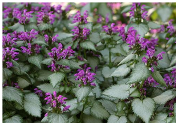
Beacon Silver ( Lamium maculatum ) Evergreen Perennial Blooms April to November Shade loving but grows anywhere