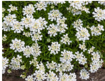
Evergreen Candytuft ( Iberis commutata ) Perennial Blooms Spring and Summer