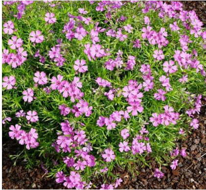
Creeping phlox ( Phlox subulata ) Perennial Flowers Spring to Early Summer Needs full sun