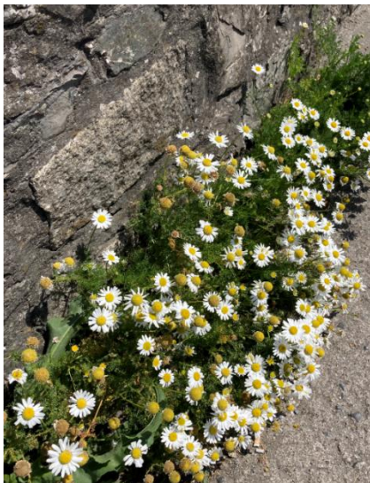
Mayweed (Wild Chamomile) ( Chamaemelum nobile ) Mat forming perennial Daisy like flower in Summer Deciduous Full sun or partial shade