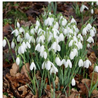
Snowdrop ( Galanthus sp.) Dwarf bulbous perennial Deciduous Full sun/partial shade White flowers January/February