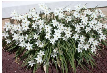
Spring Starflower ( Ipheoin sp.) Bulbs/deciduous/perennial Bloom late Winter/Spring Sheltered