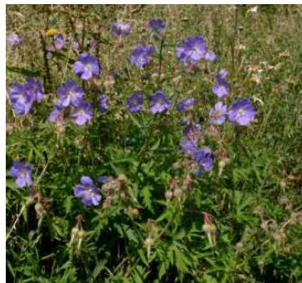
Meadow Cranesbill ( Geranium pratense ) Annual or Perennial Deciduous Shade or sunlight Blooms in Summer