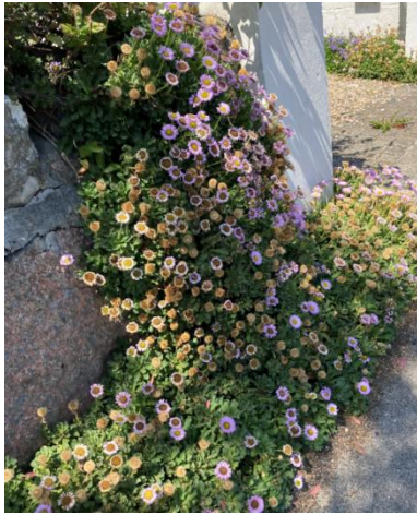
Sea Fleabane ( Erigeron glaucus ) Perennial, Low growing Summer flowering lilac pink flowers Evergreen Full sun