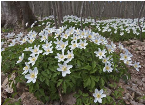
Wood anemone ( Anemone nemorosa ) Perennial Shady or partial sun Evergreen Blooms March to May