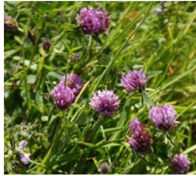
Red Clover ( Trifolium repens )