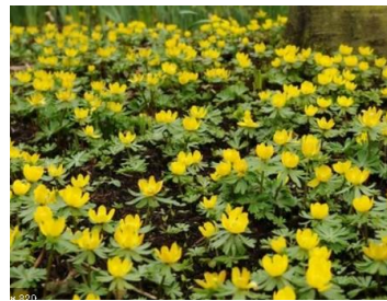
Winter Aconite/Hellebore ( Eranthis hyemalis ) Perennial Flowers Feb-March Deciduous Full sun/partial shade