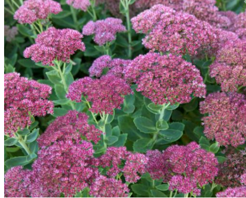
Stonecrop or Iceplant ( Sedum acre ) Evergreen Perennial Full sun Blooms early to mid Summer