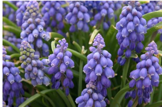
Grape hyacinth ( Muscari armeniacum ) Perennial bulb Blooms mid Spring Full sun or partial shade