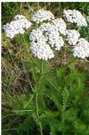
Yarrow ( Achillea millefolium ) Evergreen feathery leaves Flowers June to November Perennial Partial shade or sunlight