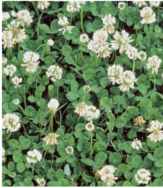
White or Pink Clover ( Trifolium repens ) Perennial Evergreen Blooms June to September