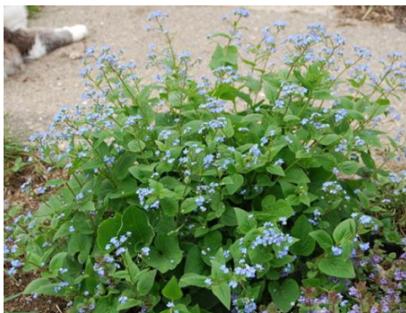
Bugloss/Alkanet ( Pentaglottis sp. ) Evergreen Blooms early to late Spring Shady moist areas