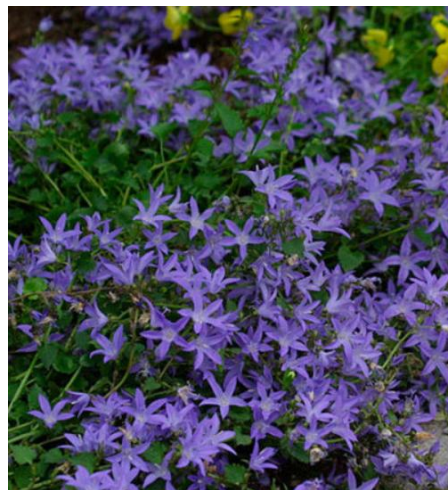
Serbian bellflower ( Campanula poscharskyana ) Semi evergreen Perennial Flowers in Summer and Autumn