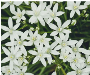
Common Star of Bethlehem ( Ornithogalum umbellatum ) Deciduous/bushy Perennial; grows from bulbs Full sun/partial shade White flowers in early Summer