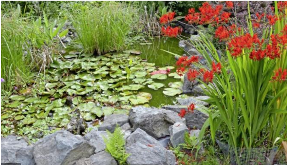
An example of a wildlife pond with rocks for shelter and planting to aerate the pond and provide resting places for insects