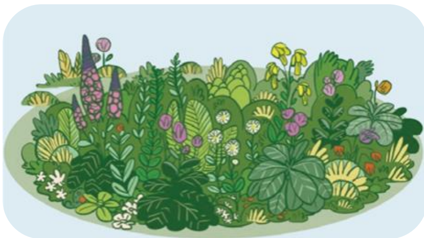
Illustration of a Bog Garden extracted from Laois Co. Co. 'Gardening for biodiversity' https://laois.ie/wp-content/uploads/Garden-Wildlife-Booklet-WEB-17MB.pdf

If a wildlife pond is not suitable, then perhaps a 'Bog Garden' might be appropriate.